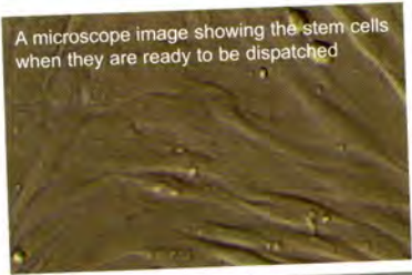
A microscope image showing the stem cells when they are ready to be dispatched

This is then sent to an authorised equine stem cell centre (laboratory) where the stem cells are separated out and cultured over a period of two to three weeks to increase their numbers.