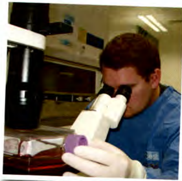
During the culture process the cells are examined regularly to check their progress.

It's not just tendon injuries that can benefit from stem cells. A 6-year-old Welsh Section D gelding with a stifle injury has benefitted from stem cell therapy in recent months. He had a split in the cartilage in his stifle and a partial rupture of the caudal cruciate ligament. Following stem cell implantation into the joint he is now doing very well and his vet is extremely pleased with his progress so far.